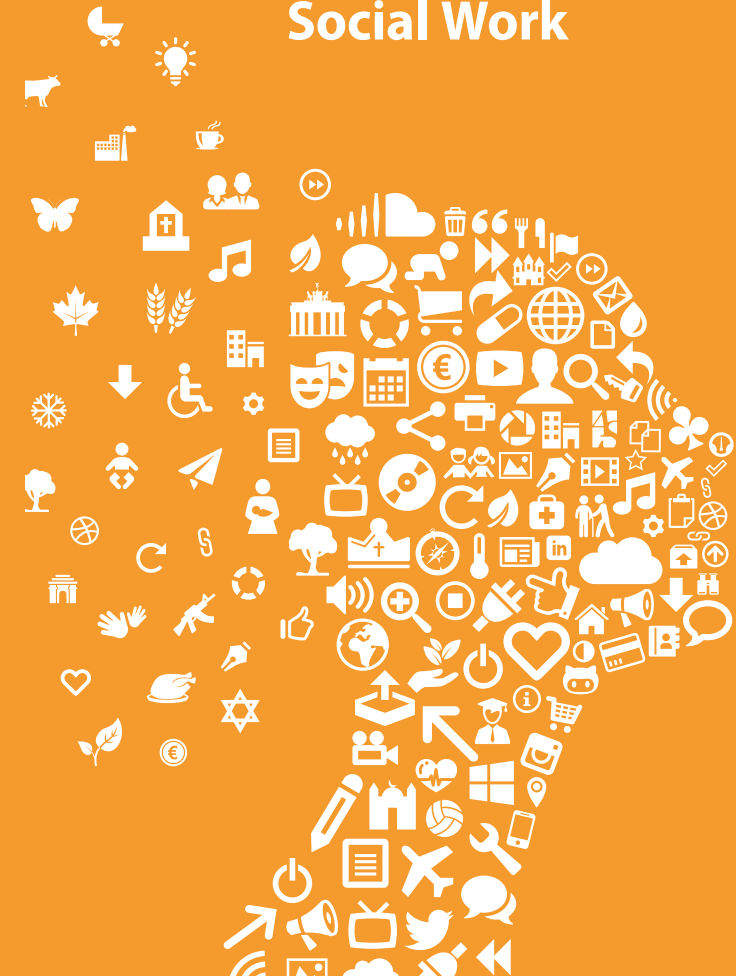
Illustration: © freepik.com, flaticon.com